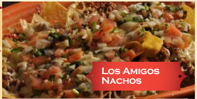
LOS AMIGOS NACHOS

Breaded fish, breaded chicken tenders, salchi-pulpo (fried weenie), two chicken taquitos and veggies. Served with spicy ranchero sauce – 14.99