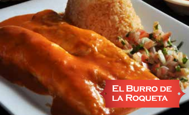
EL BURRO DE LA ROQUETA