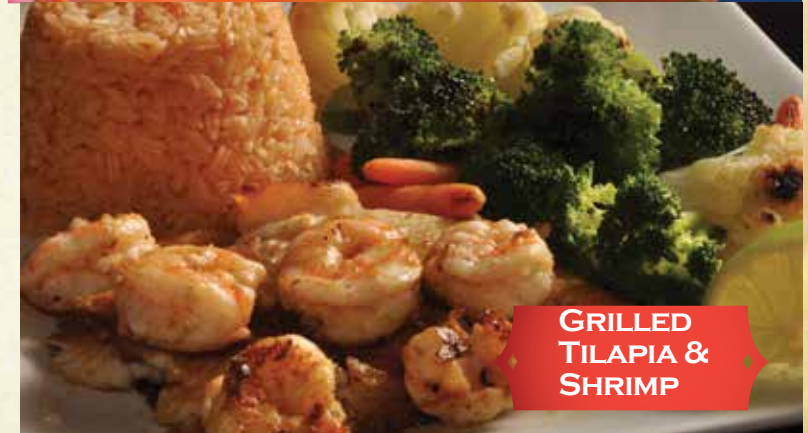
GRILLED TILAPIA & SHRIMP