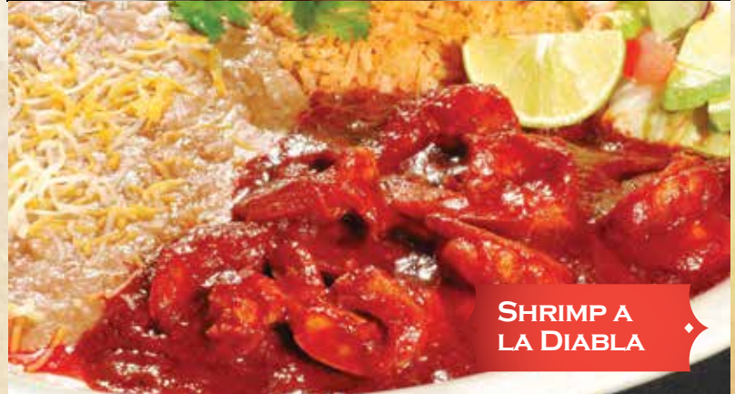
SHRIMP A LA DIABLA