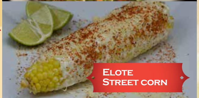
ELOTE STREET CORN