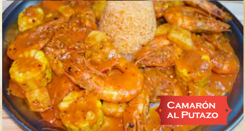
CAMARÓN AL PUTAZO